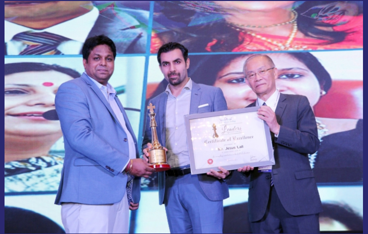
Education Leaders Award 2018 by Education Today