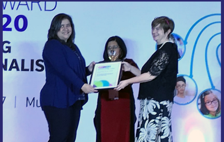
ISA - International School Award by British Council