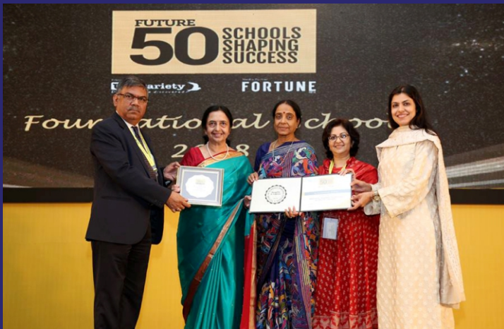
Future 50 Schools Shaping Success Award 2018