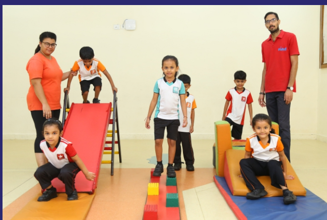
Fit Kid Programme